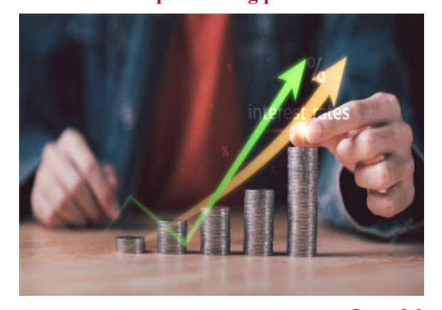
Under performing portfolios