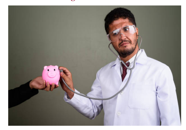
Your distribution rate